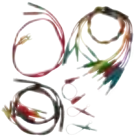
(AW0047) RW Cable Set for RM/RD/uJoule Interchange Standard ---- This cable set allows for an external Radian standard or uJoule to be put in series with the RW during a meter test for tie line testing.