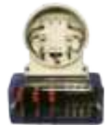
(CA000581) TTS-8 Temporary Test Switch for 5S meter ---- This allows you to remove a socket meter, plug in the adapter with the test switch and then plug the meter into the adapter for 5S meters.