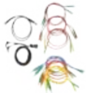
(AL0033) RW Standards Compare Kit for an External RM Standard