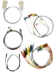
(AL0032) RW Standards Compare Kit for an External RD-2x or RD-3x Standard

Use an external standard and a Standards Compare Kit you can make sure your RW's internal standard is delivering the high accuracy results you need. All of the necessary cables are included, and the RW's on-board software provides simple to use test step entry to accommodate a standards compare test.