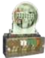
(CA000579) TTS-13 Temporary Test Switch for 6S and 9S meters ---- This allows you to remove a socket meter, plug in the adapter with the test switch and then plug the meter into the adapter for 6S and 9S meters.