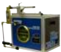
(AE0016) WECO 3230 3-Phase Shop Stand Adapter for RW, Integrated Smart Socket, USB Interface ---- This allows you to utilize the RW's features while on site in the van, as well as back at the shop. See the following page for additional information.